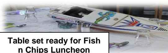
Table set ready for Fish n Chips Luncheon