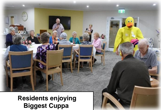
Residents enjoying Biggest Cuppa