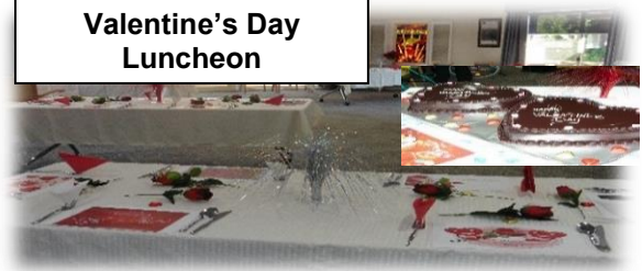
Valentine's Day Luncheon