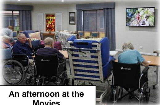
An afternoon at the Movies