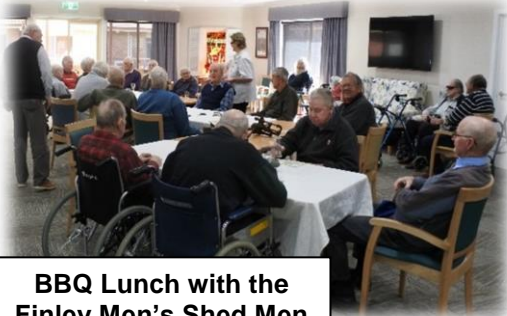
BBQ Lunch with the Finley Men's Shed Men