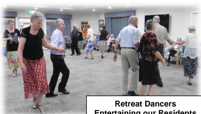
Retreat Dancers Entertaining our Residents