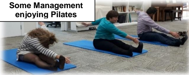
Some Management enjoying Pilates