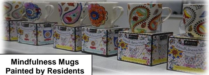
Mindfulness Mugs Painted by Residents