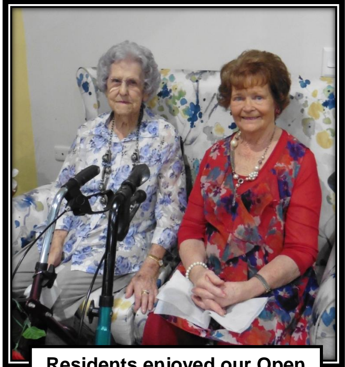
Residents enjoyed our Open Day and helped us show off our wonderful newly renovated Activities Room and Houses to Hon Sussan Ley (Minister for Health, Aged Care & Sport)