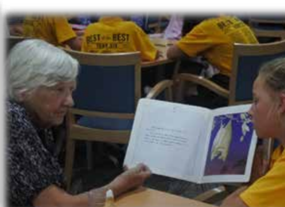
Finley Primary School Students enjoying craft and drawing as well as reading with our Residents