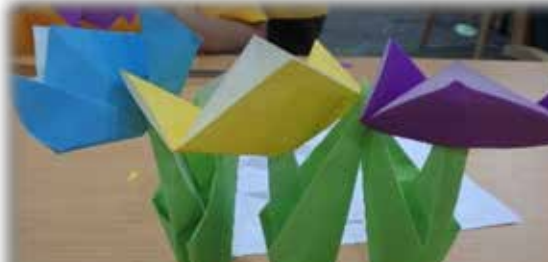
Gorgeous Tulips made in craft session by Primary School Students