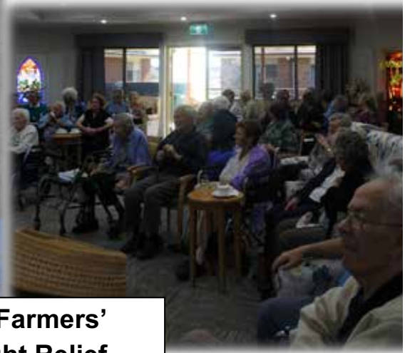
More Farmers' Drought Relief Fundraising photos – lots of fun, laughs and entertainment