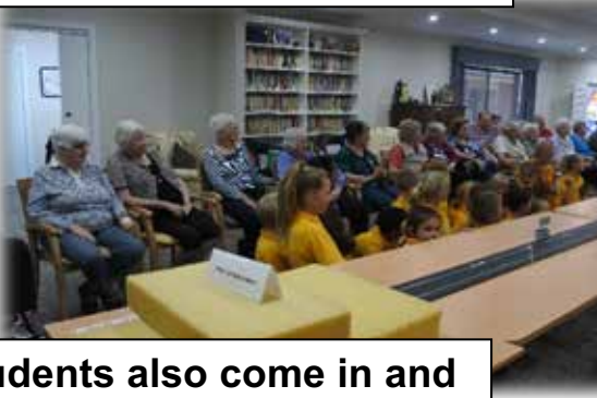
Finley Primary School Students also come in and enjoy the excitement of Drag Racing with our competitive Residents