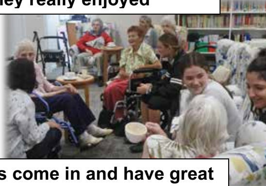
Finley High School Students come in and have great chats and enjoy morning tea with our Residents