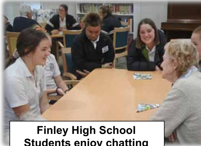
Finley High School Students enjoy chatting and having morning tea with our Residents