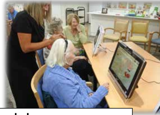
We had a guest come in and show us some new brain training program via computers for our Residents, which they really enjoyed