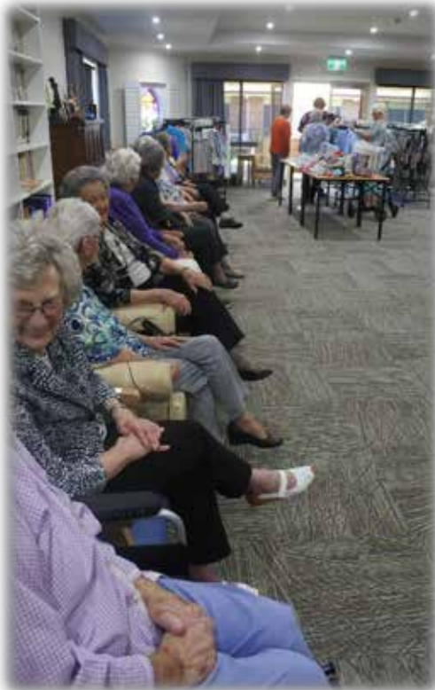
Blumes Fashions, an Auxiliary Fundraiser, where our Ladies get to admire and then buy some new clothes