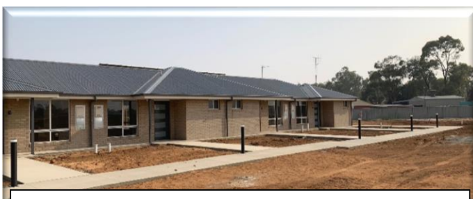
New six 1-bedroom apartments almost completed – now ready for landscaping

The 2nd stage of Alumuna is well underway with ten 2 or 3-bedroom homes and six 1-bedroom apartments due for completion in the New Year