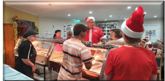
Delicious Lunch provided by our Wonderful Kitchen Staff