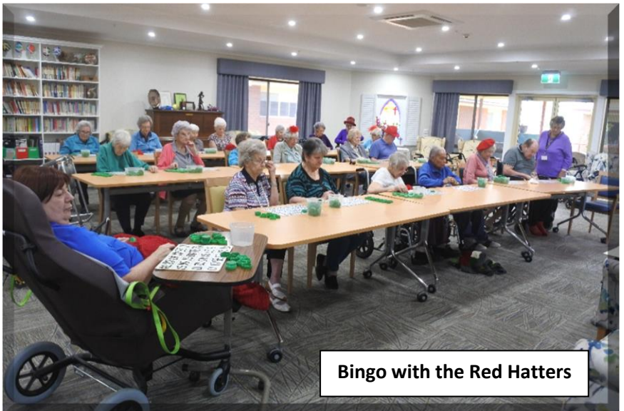
Bingo with the Red Hatters