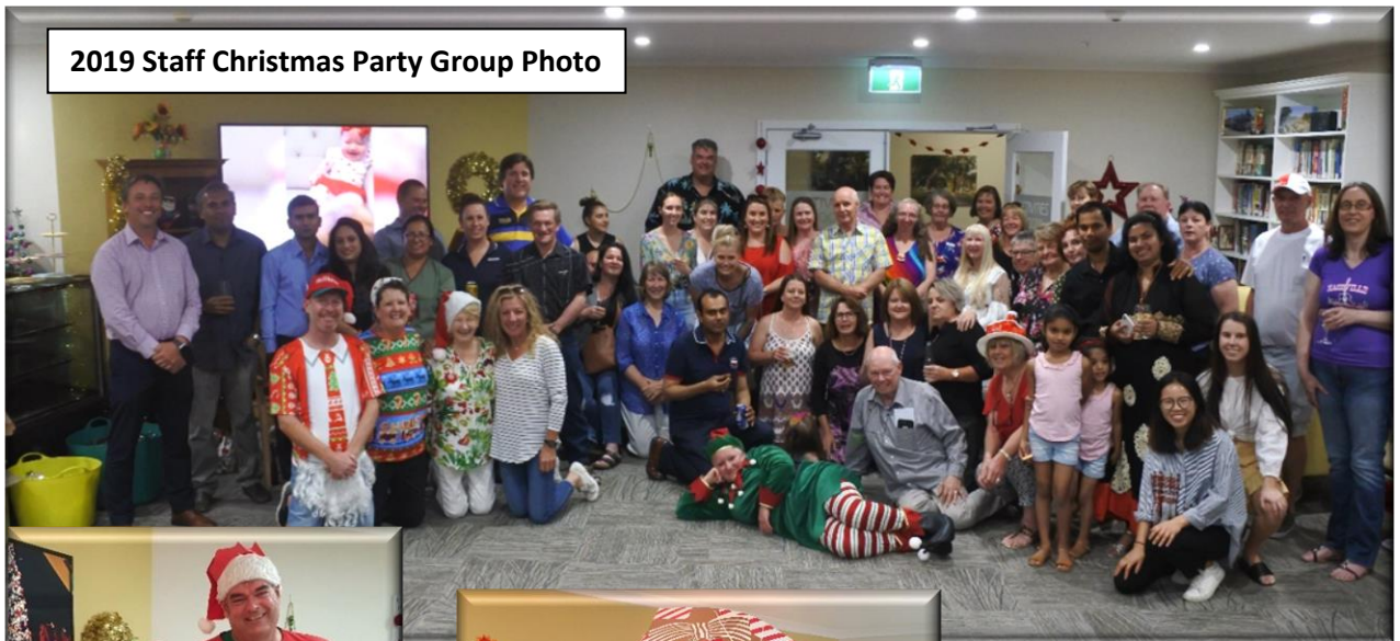
2019 Staff Christmas Party Group Photo