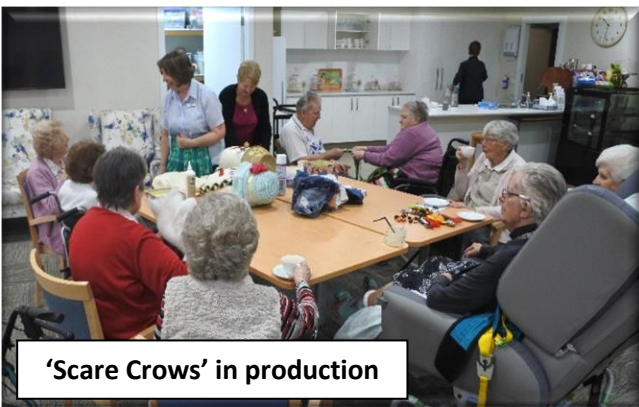
'Scare Crows' in production