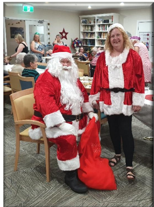
Santa & Mrs Clause