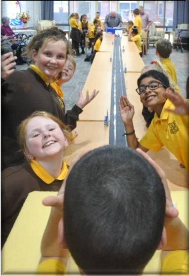
Primary Kids at Slot Car Racing