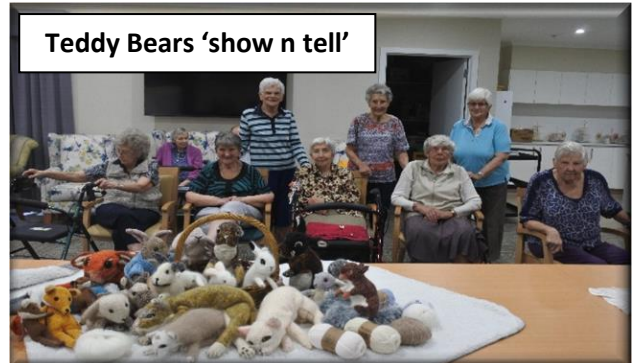
Teddy Bears 'show n tell'