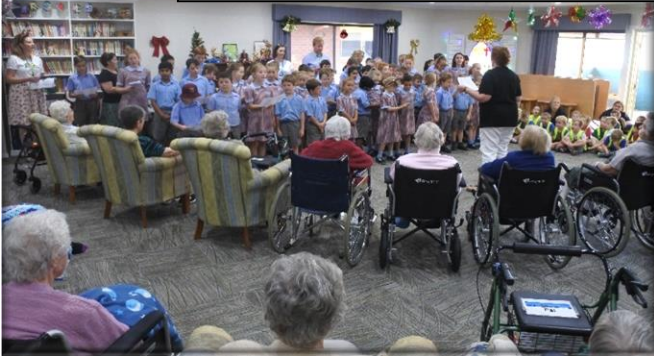
Primary & Pre School Kids came and entertained with Christmas Carols