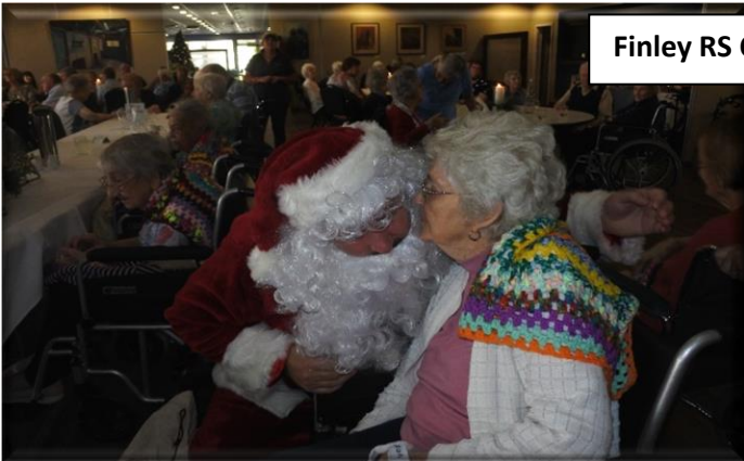
Finley RS Club Seniors Christmas Luncheon with Santa