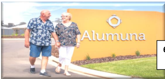
60 Scoullar Street Finley