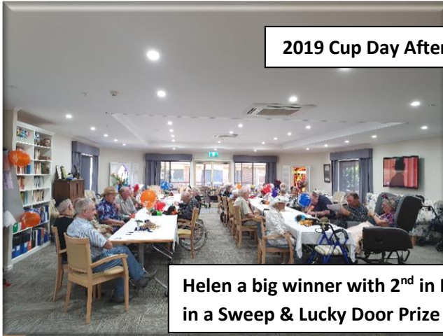
2019 Cup Day Afternoon Tea and Race