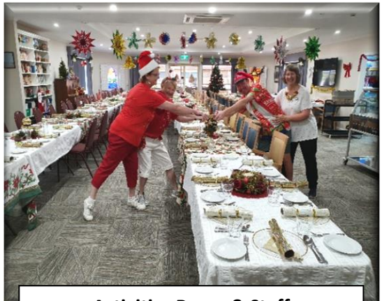
Activities Room & Staff 'dressed to impress'