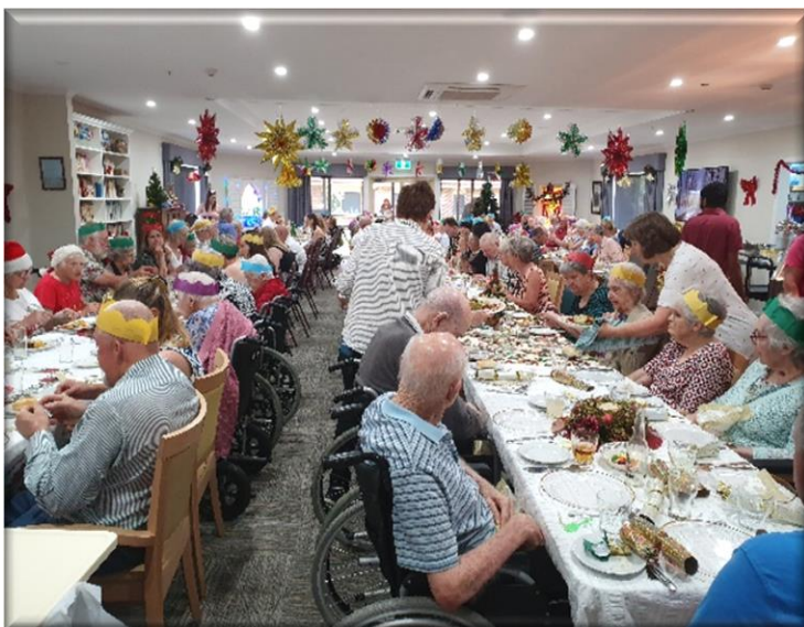
Our Residents, Clients and Family Members enjoyed a delicious Christmas Luncheon

Holding the function on a day as close as possible to Christmas day, meant that we could fully cater and support the wonderful celebration in style. Feedback on the day was very positive, with some great suggestions for a bigger and better Christmas 2020. Special mention also to the Finley Returned Services Club and Finley Golf Club for the loan of extra equipment. It was greatly appreciated.