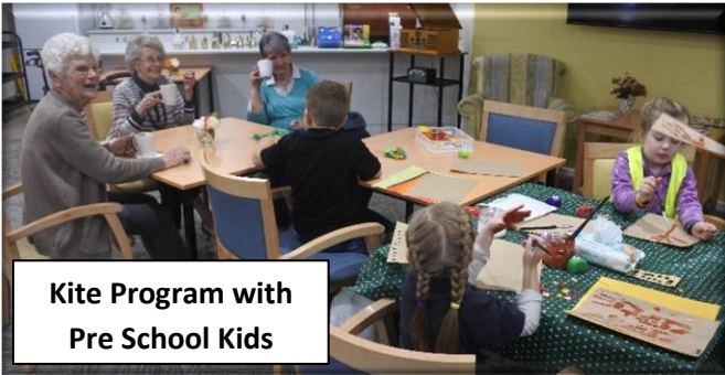
Kite Program with Pre School Kids