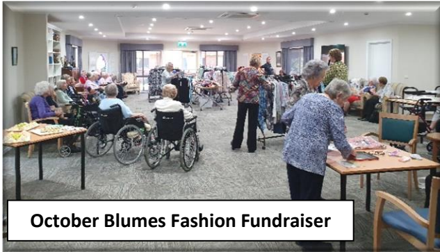
October Blumes Fashion Fundraiser